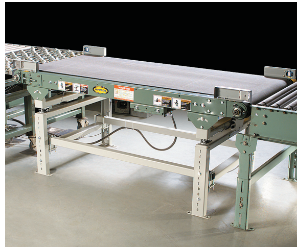
Weigh Legs with in-motion conveyor section

Weighing Accuracy – In-motion accuracy is dependent upon conveyor speed, package spacing, etc. Consult factory.