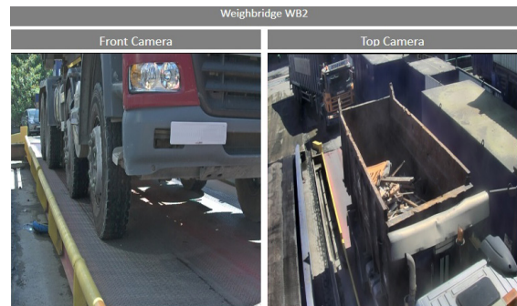
Enhanced vehicle image and video capture showing overhead view and wheel positioning

Monitoring the weighbridge through live image capture can help to ensure site safety standards are being met and can be reviewed in the event of an accident to back up claims of fault.