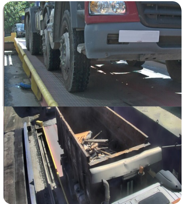
Vehicle positioning and overhead cameras capture images to be stored in Weighman8

Enhanced mode: Monitor activity on four weighbridges, each with up to two fixed cameras with live streaming.