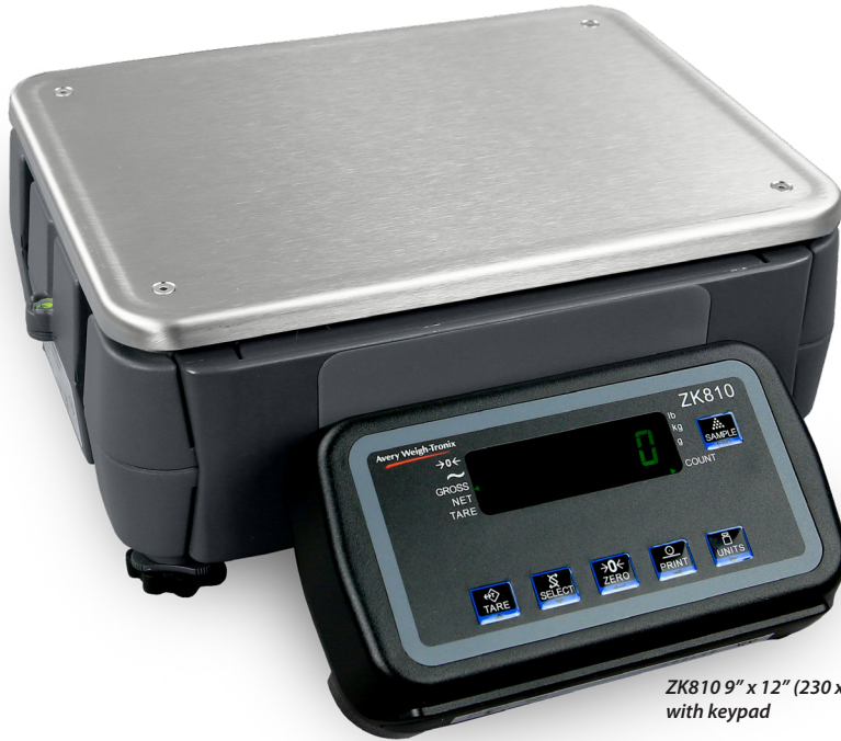
ZK810 9" x 12" (230 x 305 mm) with keypad

High resolution industrial digital scale