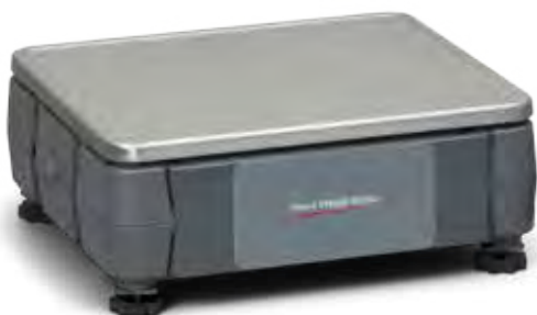
Large scale base 305 mm x 355 mm 35 kg & 80 kg

The Quartzell's digital signal allows the scale to weigh faster and with greater resolution than standard load cells. Small and large items can be weighed on a single base, allowing one scale to do a job that might previously have required several. With a fast return to zero between readings, the BSQ provides the speed and repetitive accuracy that can be vital in situations where highly accurate weight readings are required.