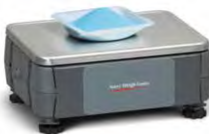
Medium scale base 230 mm x 305 mm 35 kg