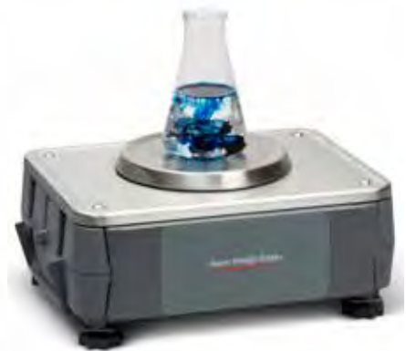
Small scale base 152 mm dia 1 kg & 5 kg